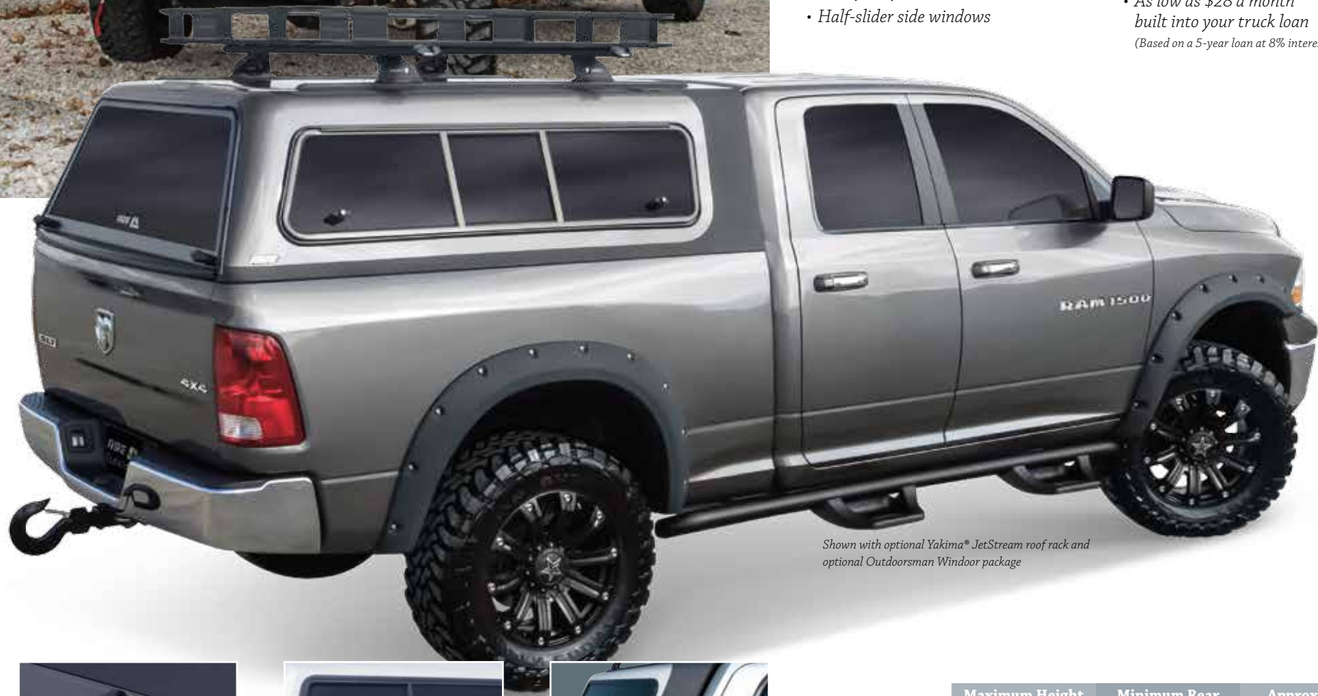
Shown with optional Yakima® JetStream roof rack and optional Outdoorsman Window package