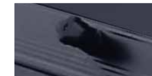
Single T-Lock Heavy-Duty Rear Door