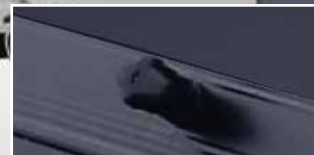
Single T-Lock Heavy-Duty Rear Door