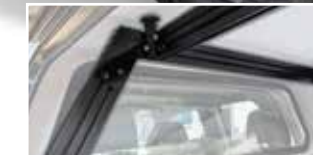
Standard Internal Aluminum Skeleton

For further specifications, refer to model specific specifications. (CX page 6 – MX page 10)