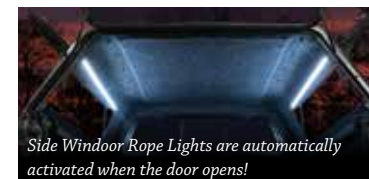
Side Window Rope Lights are automatically activated when the door opens!