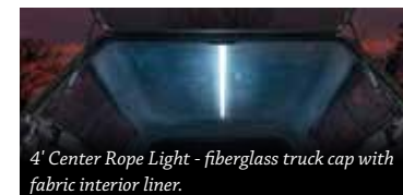
4' Center Rope Light - fiberglass truck cap with fabric interior liner.