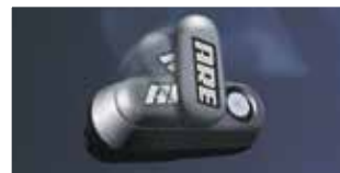
Integrated Palm Handle