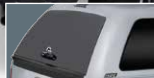
Frameless Curved Door Styling