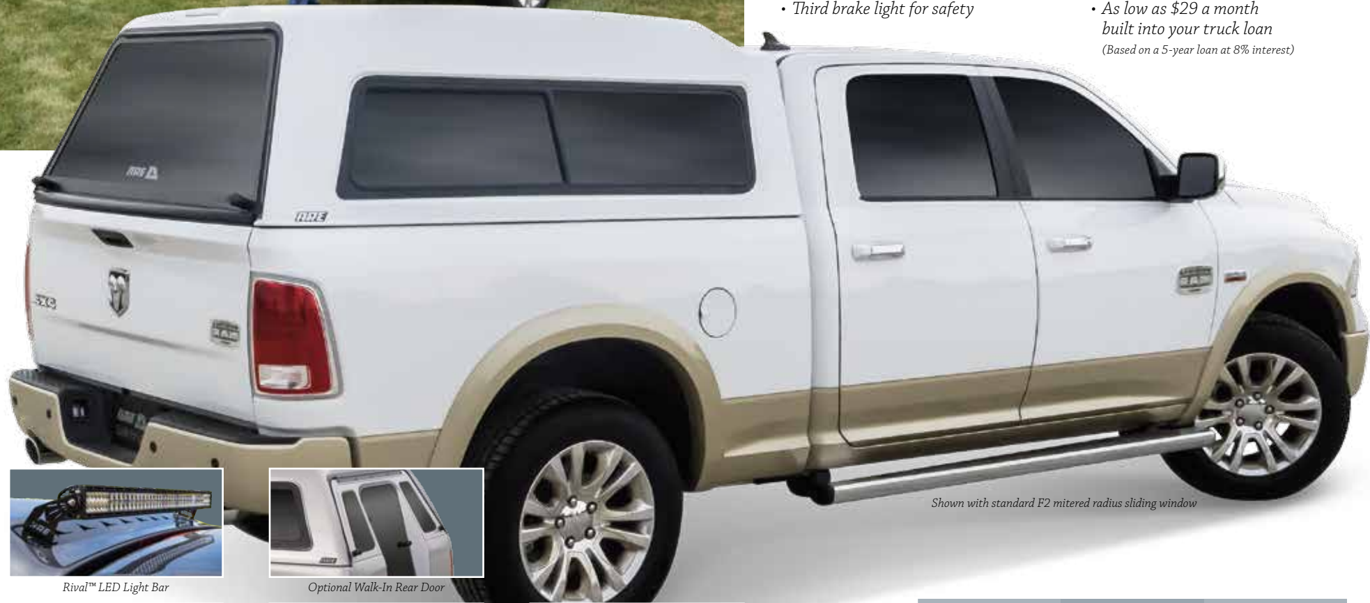
Shown with standard F2 mitered radius sliding window