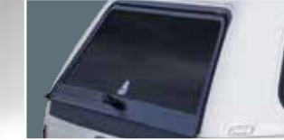
Heavy-Duty Aluminum Door