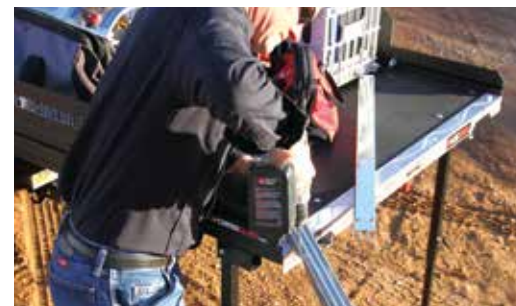
Convert your CargoGlide into a worktop with the optional stabilizing legs