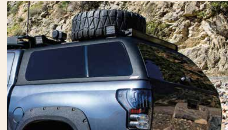
Spray-on protective coating increases strength in high stress areas.