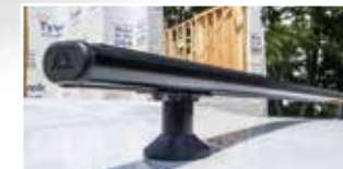
Optional HD Series Roof Rack