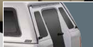
Optional Walk-In Rear Door