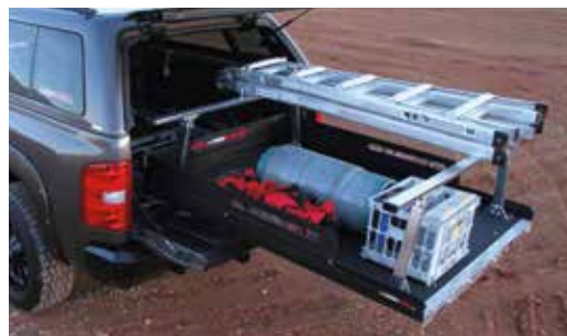
Increase your storage with the optional cargo rack