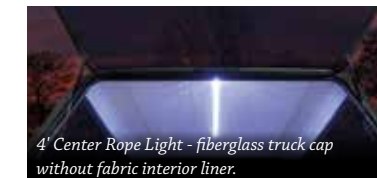
4' Center Rope Light - fiberglass truck cap without fabric interior liner.