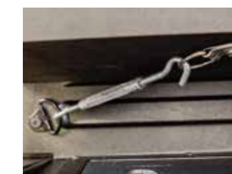
No-drill turn buckle installation