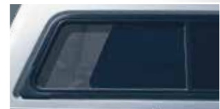
F2 Mitered Half-Slider