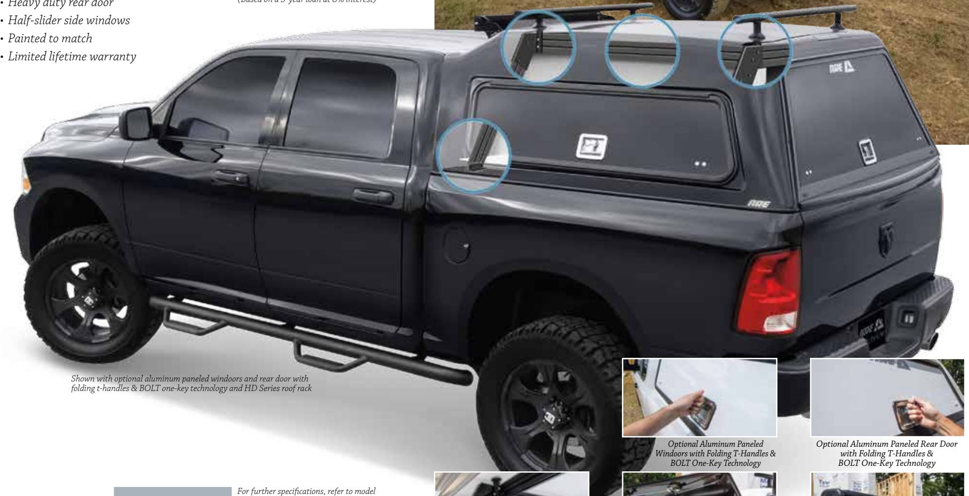
Shown with optional aluminum paneled windows and rear door with folding t-handles & BOLT one-key technology and HD Series roof rack