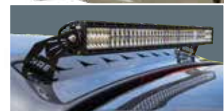
Rival™ LED Light Bar