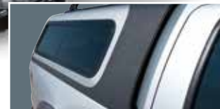
Spray-On Protective Coating Increases Strength in High Stress Areas