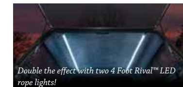
Double the effect with two 4 Foot Rival™ LED rope lights!