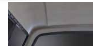
Fiberglass Finish Interior