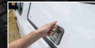
Optional Aluminum Paneled Windows with Folding T-Handles & BOLT One-Key Technology