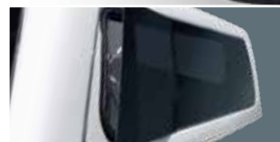
Frameless Screen Vent