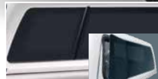
Optional SV Screen Vent Window Package