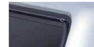
Continuous Hinge System