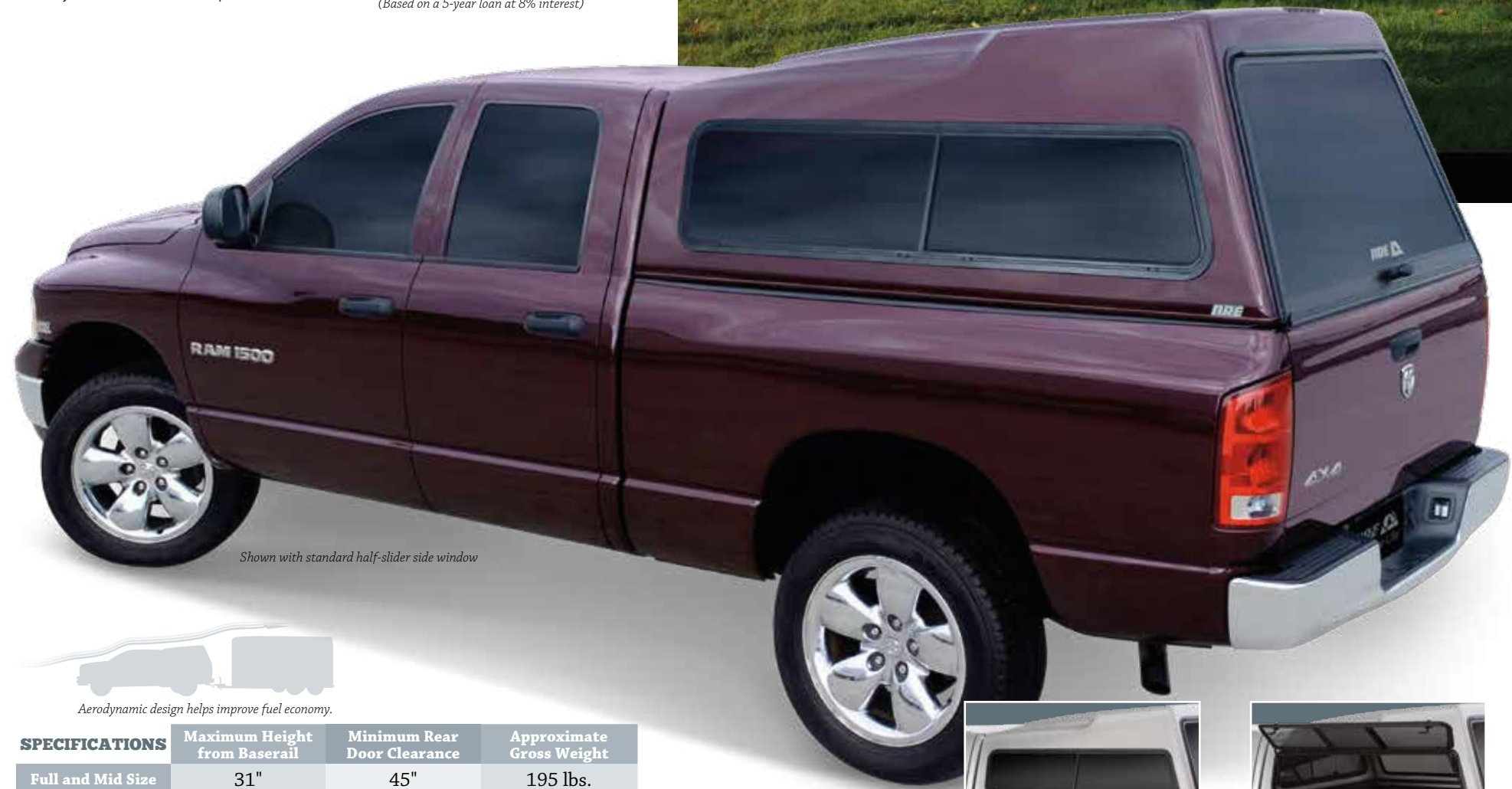
Shown with standard half-slider side window