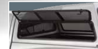
Outdoorsman Window (vented)