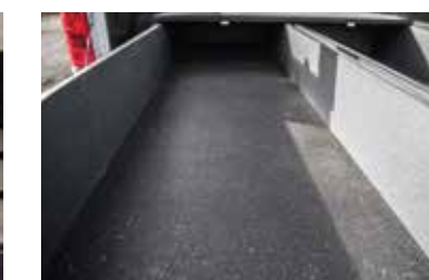
Drop-in rubber mat drawer interior