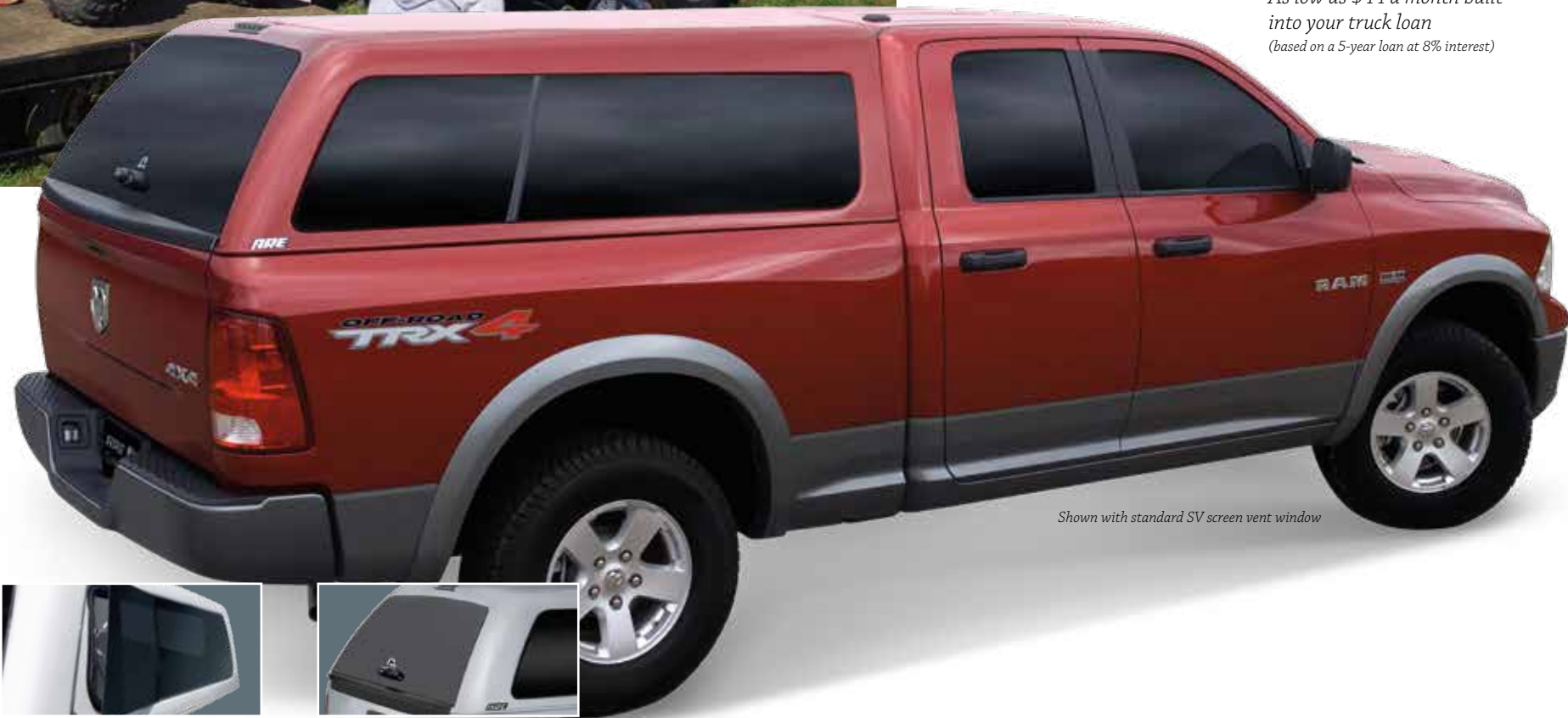
Shown with standard SV screen vent window