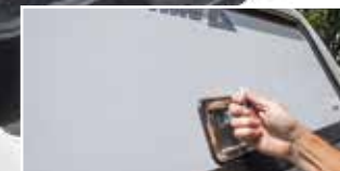
Optional Aluminum Paneled Rear Door with Folding T-Handles & BOLT One-Key Technology