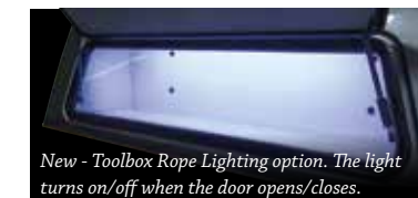
New - Toolbox Rope Lighting option. The light turns on/off when the door opens/closes.