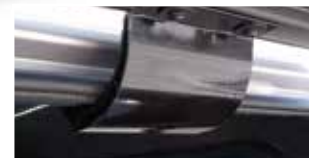
Hidden Hinge System