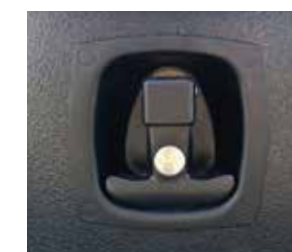
Folding T-handle lock