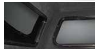
Gray Carpet Interior