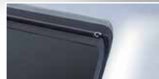
Continuous Hinge System