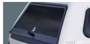
Heavy-Duty Aluminum Door