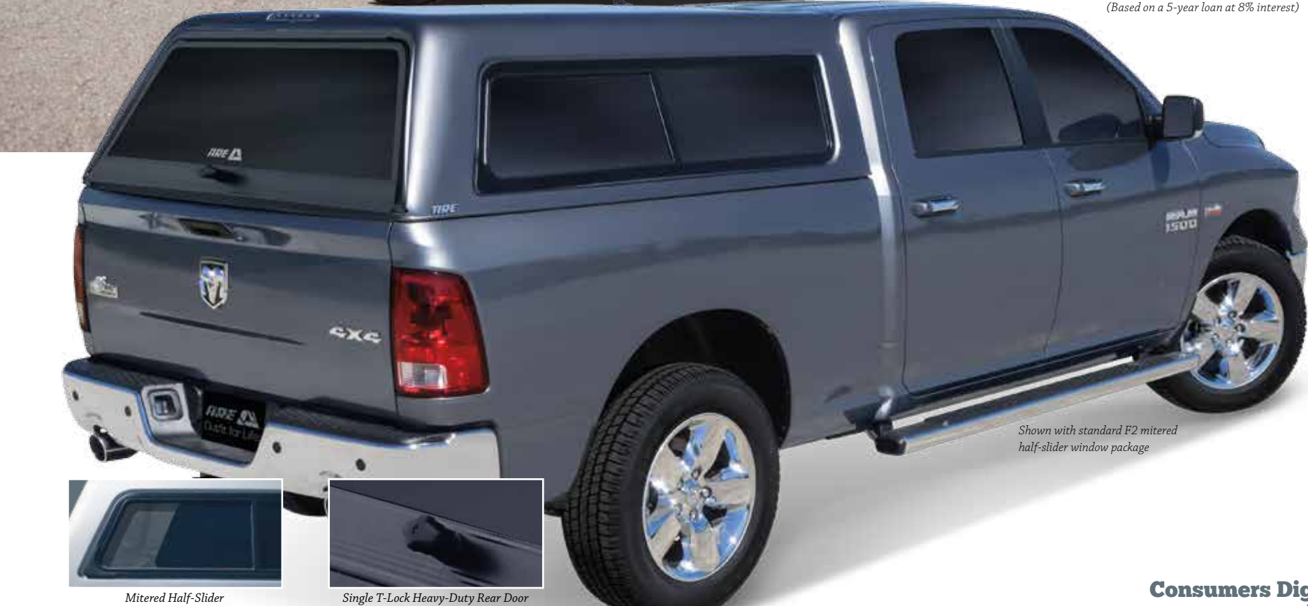
Shown with standard F2 mitered half-slider window package