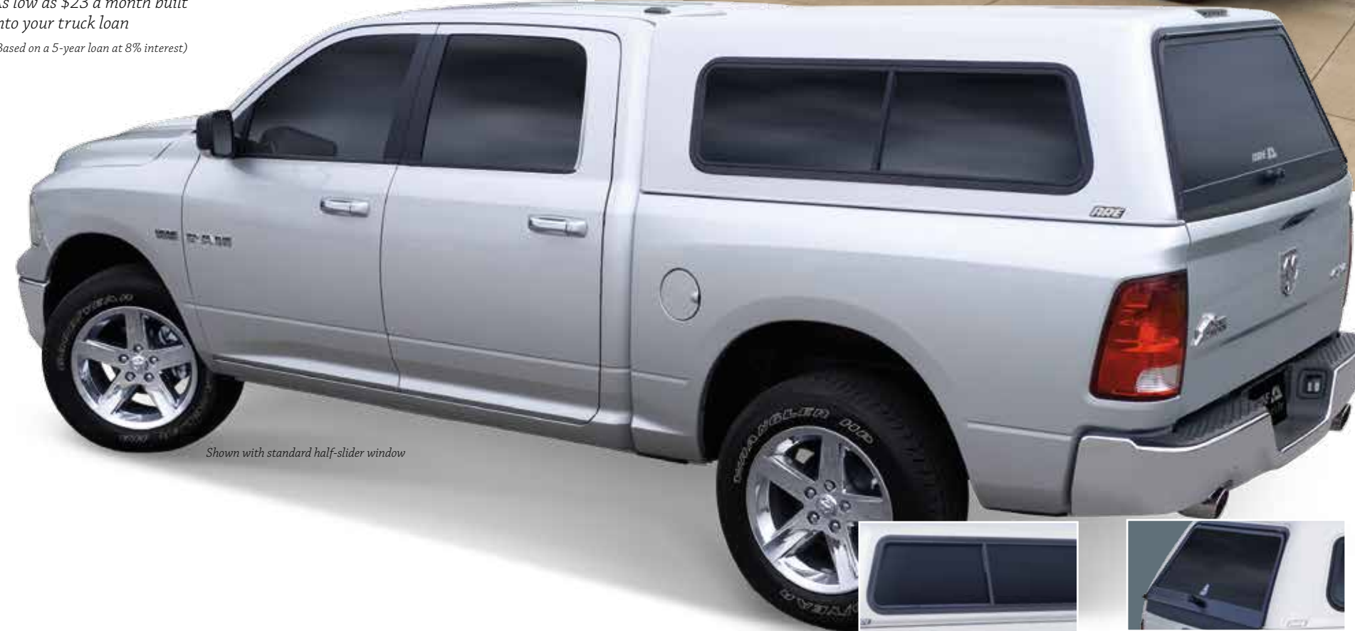
Shown with standard half-slider window