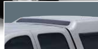
Front Vista Glass (Not a Skylight)