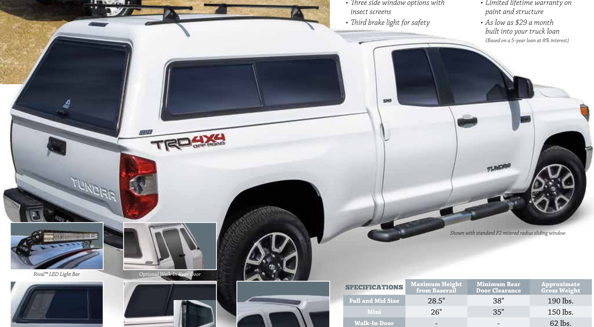
Shown with standard F2 mitered radius sliding window