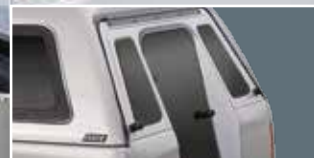
Optional Walk-In Rear Door