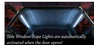
Side Window Rope Lights are automatically activated when the door opens!