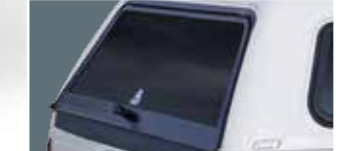
Heavy-Duty Aluminum Door