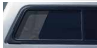
F2 Mitered Half-Slider