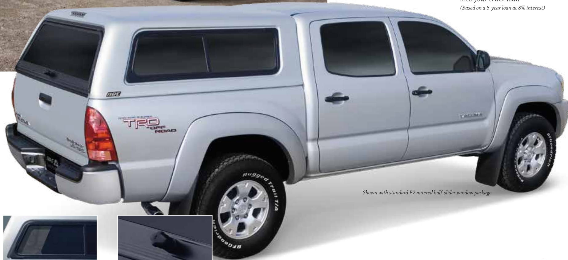
Shown with standard F2 mitered half-slider window package