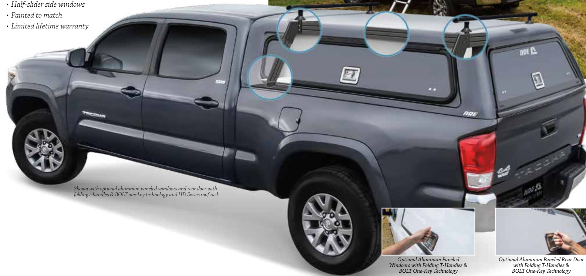
Shown with optional aluminum paneled windows and rear door with folding t-handles & BOLT one-key technology and HD Series roof rack