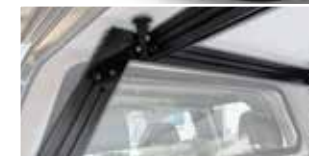
Standard Internal Aluminum Skeleton