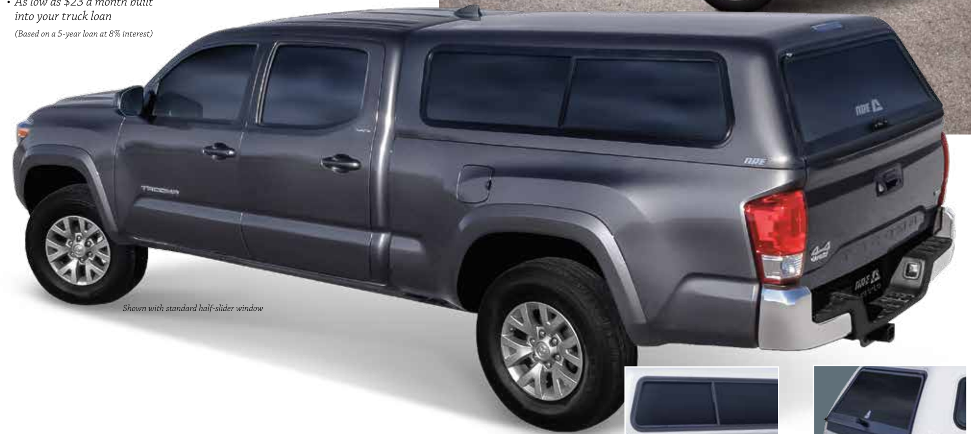
Shown with standard half-slider window