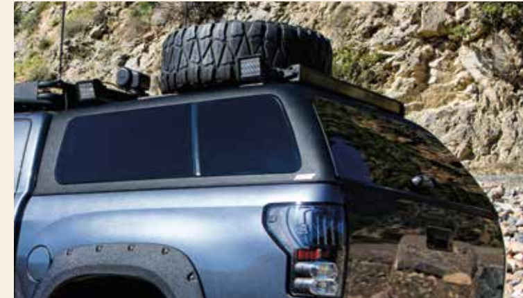
Spray-on protective coating increases strength in high stress areas.