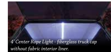
4' Center Rope Light - fiberglass truck cap without fabric interior liner.