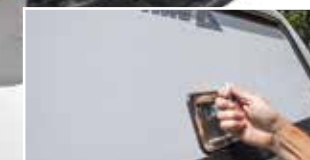
Optional Aluminum Paneled Rear Door with Folding T-Handles & BOLT One-Key Technology