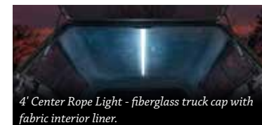
4' Center Rope Light - fiberglass truck cap with fabric interior liner.