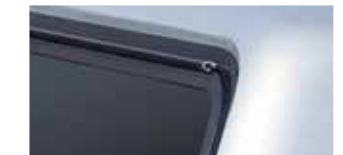
Continuous Hinge System