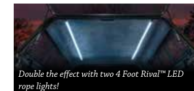
Double the effect with two 4 Foot Rival™ LED rope lights!