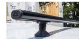
Optional HD Series Roof Rack