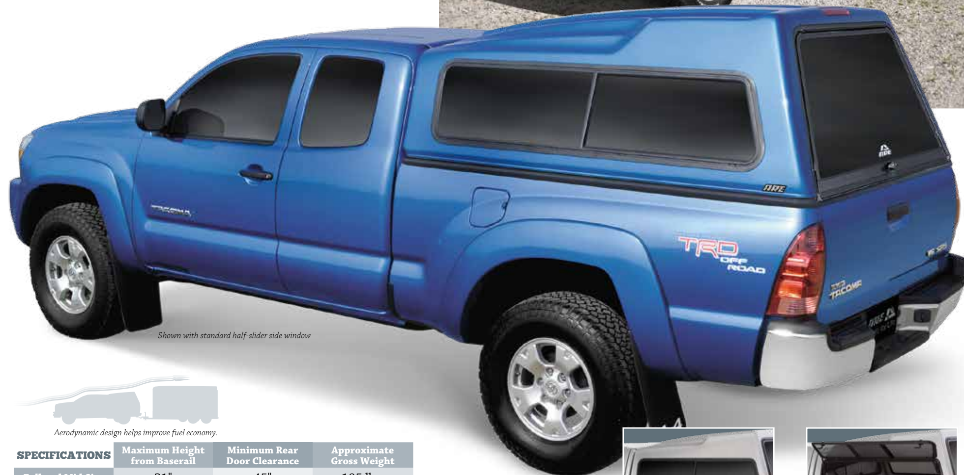
Shown with standard half-slider side window