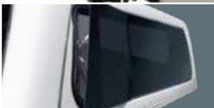
Frameless Screen Vent