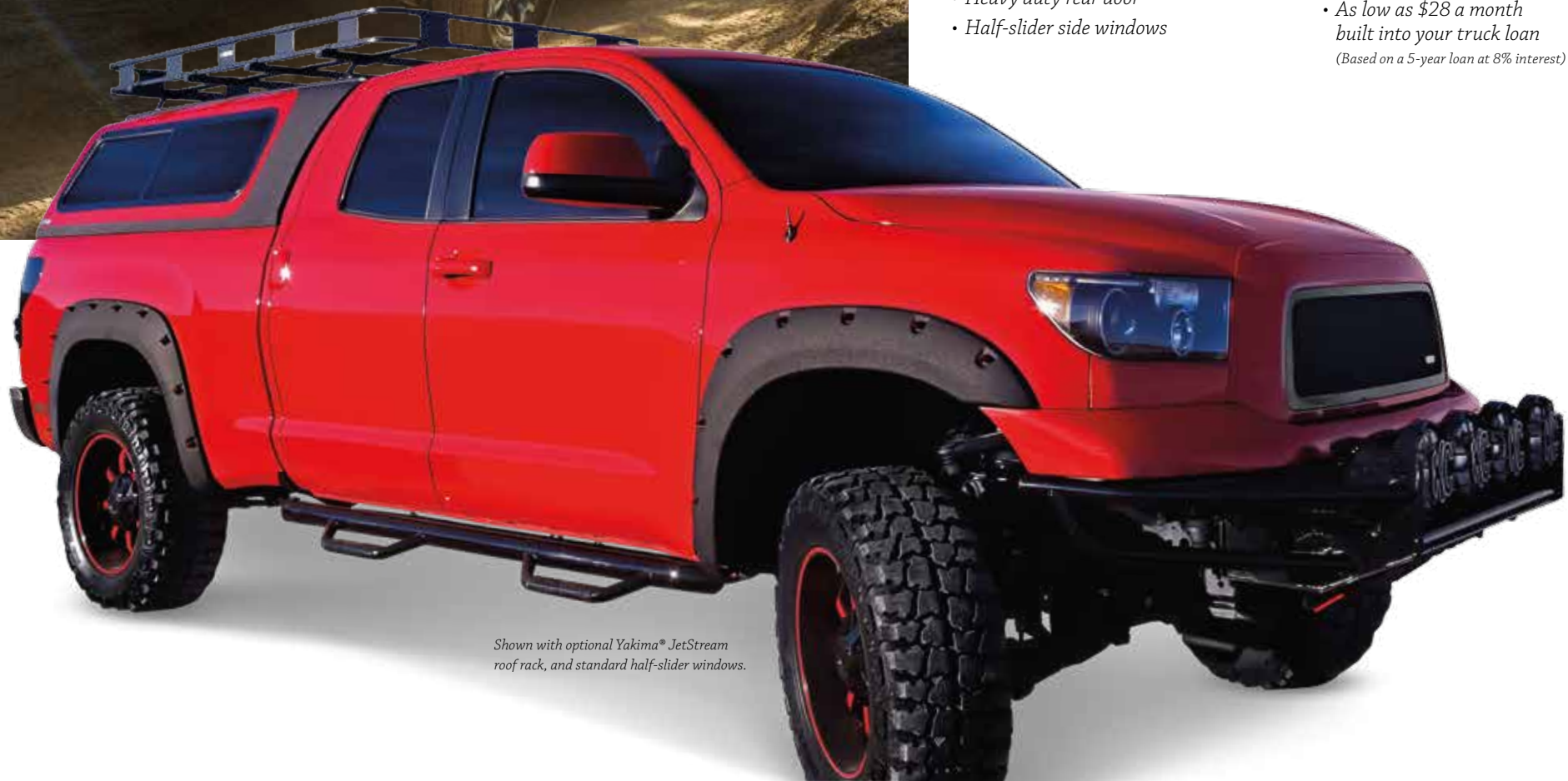
Shown with optional Yakima® JetStream roof rack, and standard half-slider windows.