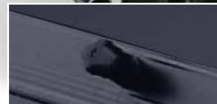
Single T-Lock Heavy-Duty Rear Door