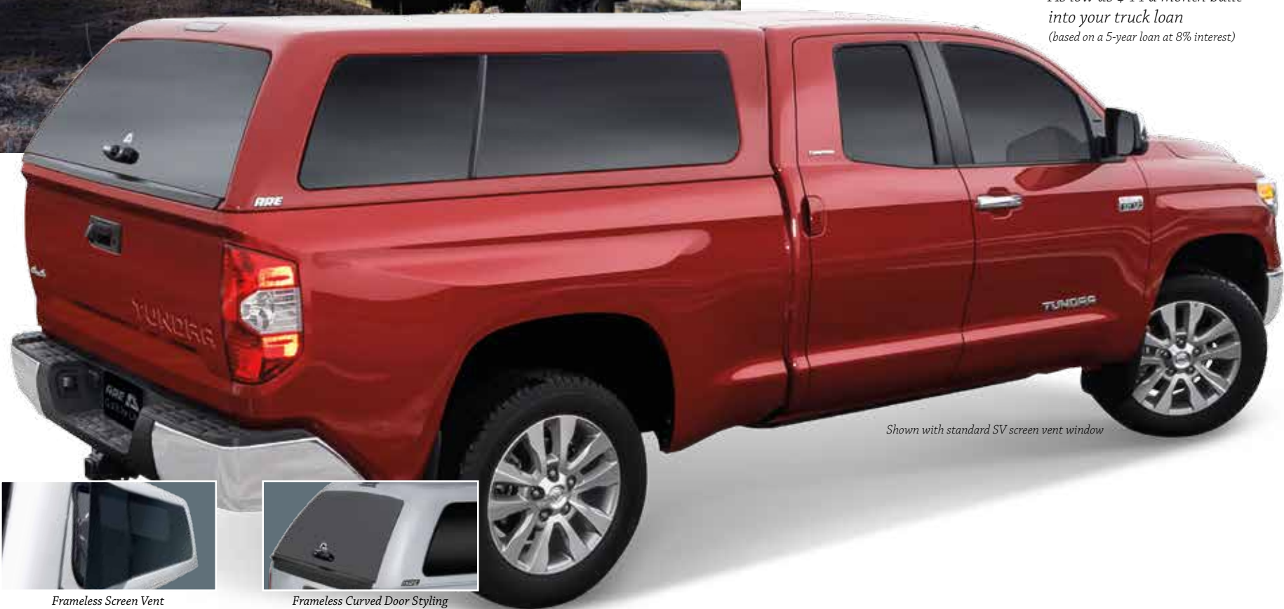
Shown with standard SV screen vent window