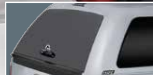
Frameless Curved Door Styling