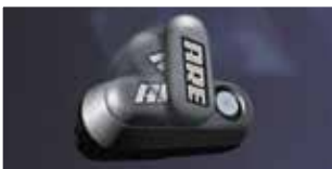
Integrated Palm Handle