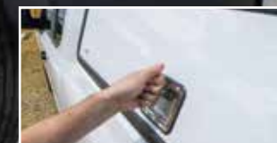
Optional Aluminum Paneled Windows with Folding T-Handles & BOLT One-Key Technology