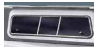
Optional Outdoorsman Window Package