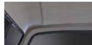
Fiberglass Finish Interior