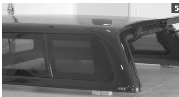
5 Place cap on level ground, elevating with wood blocks while not in use.

NOTE: While the cap is off, check the cap tape to make sure that it is in good condition. If not, contact your local A.R.E. dealer to order replacement tape.