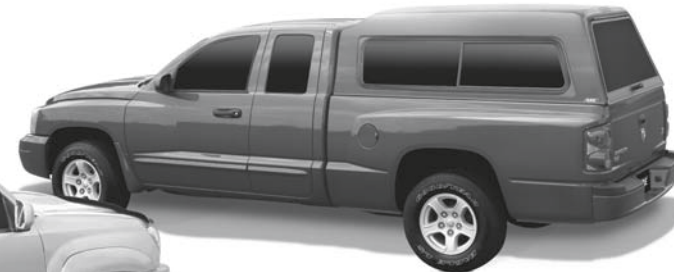
5 Reinstall mounting clamps. Do not overtighten clamps, which could cause damage to your truck bed.