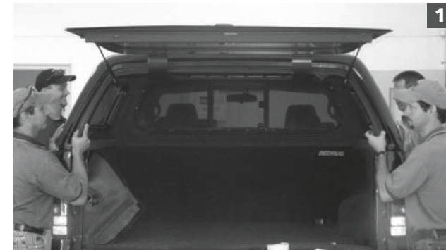
1 Place cap onto truck bed rails (see removal NOTE: step 5).