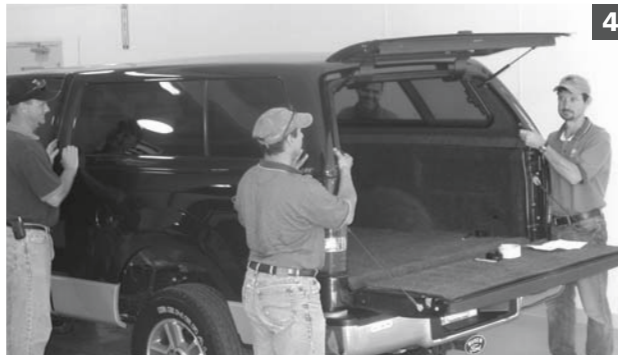
4 Remove cap from truck.