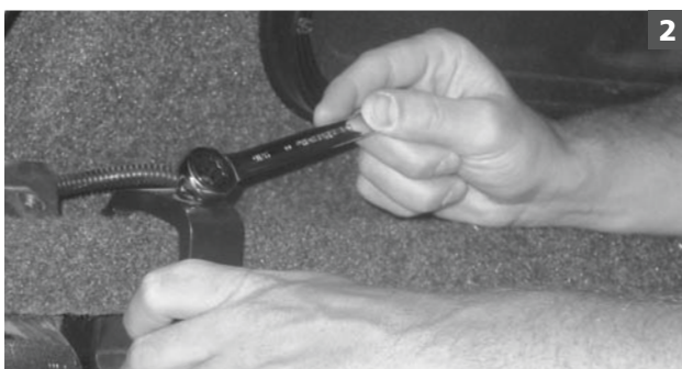
2 Remove clamps.