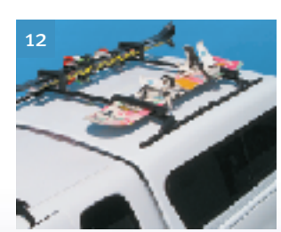
Nomadic® Roof Rack