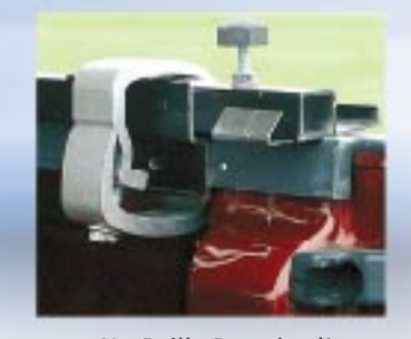
No Drills Required!