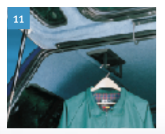
Interior Clothes Rod