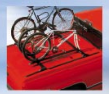
Nomadic® Roof Rack Handles Any Toys

The painted Palm Grip handle blends in with the LSII body. An easy twist of the wrist unlatches the LSII without removing gloves or subjecting fingernails to possible breakage. The dual cut key goes into the lock easily the first time and turns to lock or unlock the LSII quickly.